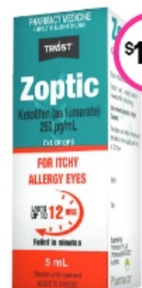
Zoptic Eye Drops 5ml*

*Always read the label & follow directions for use.