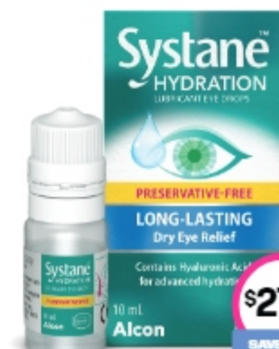
Systane Hydration MDPF 10ml*

*Always read the label & follow directions for use.