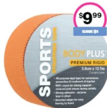
Body Plus Rigid Strapping Tape 3.8cm*

*Always read the label & follow directions for use.