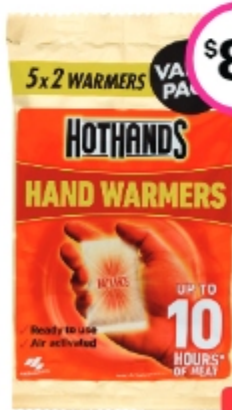
Hot Hands Hand Warmers*

*Always read the label & follow directions for use.