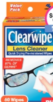
Clearwipe Lens Cleaner 60 Wipes*

*Always read the label & follow directions for use.