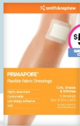
Smith & Nephew Primapore Range*

*Always read the label & follow directions for use.