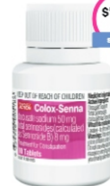
Pharmacy Action Colox-Senna 90 Tabs*

ALWAYS READ THE LABEL AND FOLLOW THE DIRECTIONS FOR USE. Trademarks are owned by or licensed to the Aspen Group of companies. © 2024 Aspen Group of companies or its licensor. All rights reserved. Aspen Pharmacare Australia Pty Ltd. 34-36 Chandos St, St Leonards, NSW 2065. ABN 51 096 236 985. COL-08093-EXP07/01/26