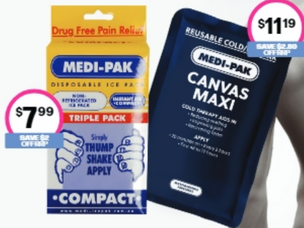
Medi-Pak Selected Products*

*Always read the label & follow directions for use.