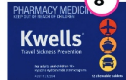
Kwells Adult 0.3mg tab 12 Tablets*